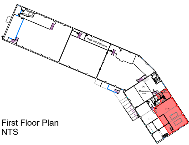
First Floor Plan NTS